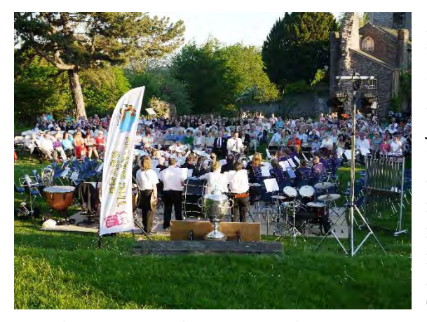
Flaming Brass at Abergavenny Castle

As a departure from our usual concert at the towns Borough Theatre, we decided to hold an open air concert in the beautiful grounds of Abergavenny Castle. On this occasion we were joined by the Ravensburg Youth Symphony Orchestra and the concert was scheduled to celebrate the arrival of the 2012 Olympic Torch in Abergavenny on 25th May 2012. Set in the majestic grounds of the, the concert programme featured orchestral classics brass and spectacular arrangement of culminating in a Tchaikovsky's 1812 Overture complete with synchronised fireworks!