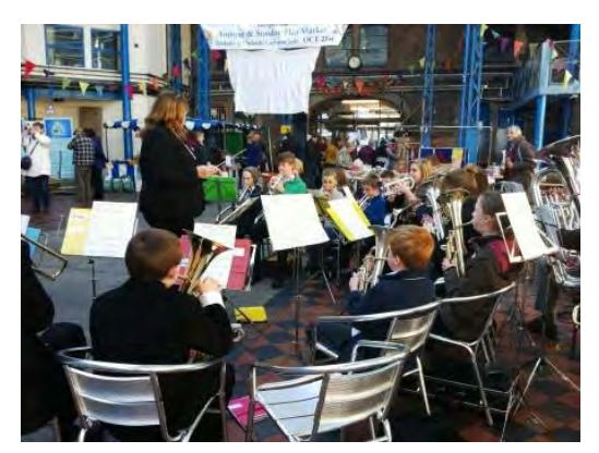
Playing at the Environment & Community Fair