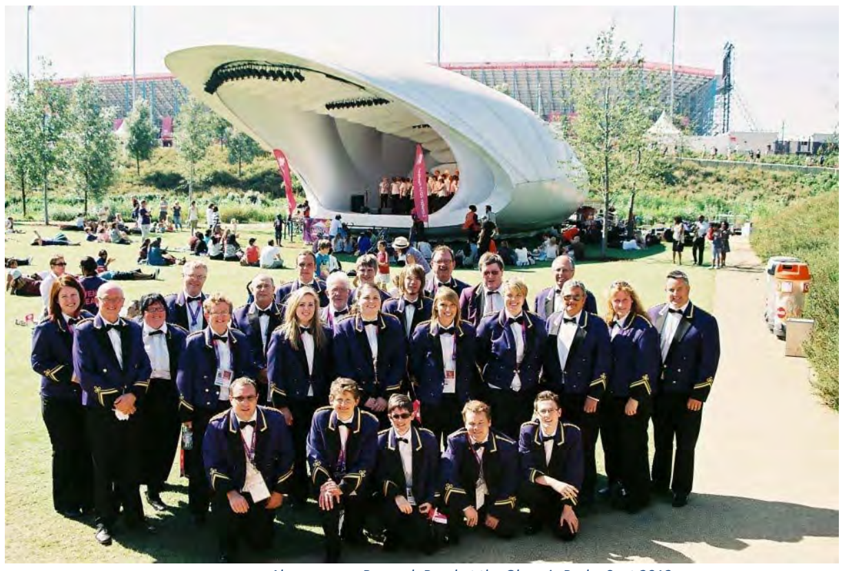
Abergavenny Borough Band at the Olympic Park - Sept 2012